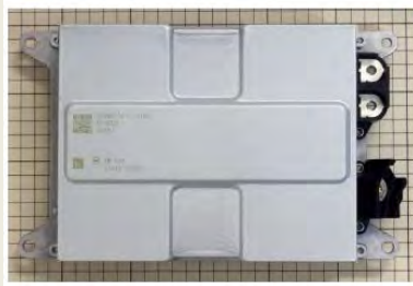
PCB (TOP View)

LTEC Corporation released its technical analysis report of DCDC converter system for the Honda Accord model.