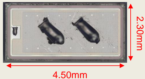
Die top view