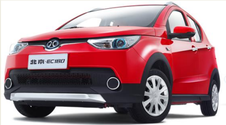
EC180 EV manufactured by Beijing Automobile Works Co., Ltd. (BAW)

February 2020. This is a teardown report of the Zhuhai Enpower inverter found in Beijing Automobile Works' EC180 electric vehicle.